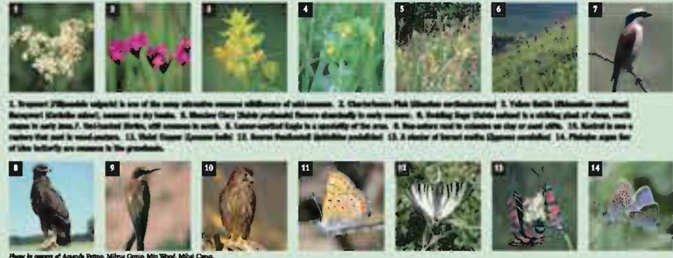
1. Trigonotis (Pulsatilla vulgaris) is one of the many attractive common wildflowers of wild meadows. 2. Cheremona Pál (Sideritis verticillata) 3. Yuhua (Sideritis verticillata) 4. Yuhua (Sideritis verticillata) 5. Yuhua (Sideritis verticillata) 6. Yuhua (Sideritis verticillata) 7. Yuhua (Sideritis verticillata) 8. Yuhua (Sideritis verticillata) 9. Yuhua (Sideritis verticillata) 10. Yuhua (Sideritis verticillata) 11. Yuhua (Sideritis verticillata) 12. Yuhua (Sideritis verticillata) 13. Yuhua (Sideritis verticillata) 14. Yuhua (Sideritis verticillata)

The Târnavia Mare area has been chosen as part of the EU's Natura 2000 network, which protects Europe's most important species and habitats. The historic landscape of the Târnavia Mare area is especially important for its abundant wildflower-rich hay meadows and pastures, oak and hornbeam forests and other habitats, which have disappeared over most of Europe. The landscape is home to many species of flowers, insects, birds and mammals that are rare in much of Europe today. The people of the area are working together to protect this biodiversity, and use it to promote local prosperity.