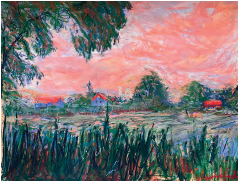
Gideon Summerfield, Golden Hour in Viscri, pastel on paper, 30 x 42 cm