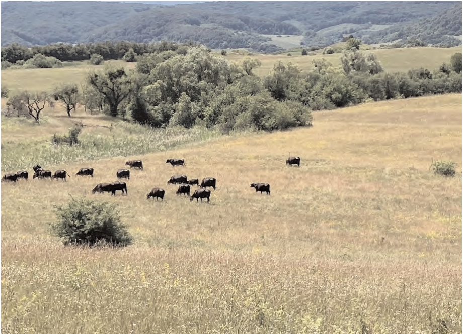
Farmed Romanian Landscape at Angofa Valley

a countryside that, managed wisely, well combines natural beauty and a productive ecosystem.