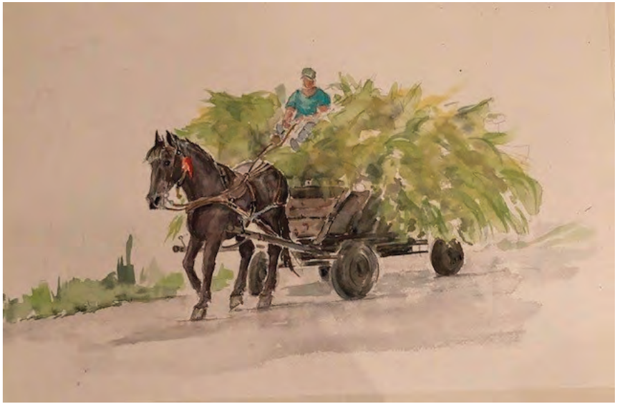
Gail Sturgis, The Black Mare, Miclosoara, watercolour, 38 x 30.5 cm