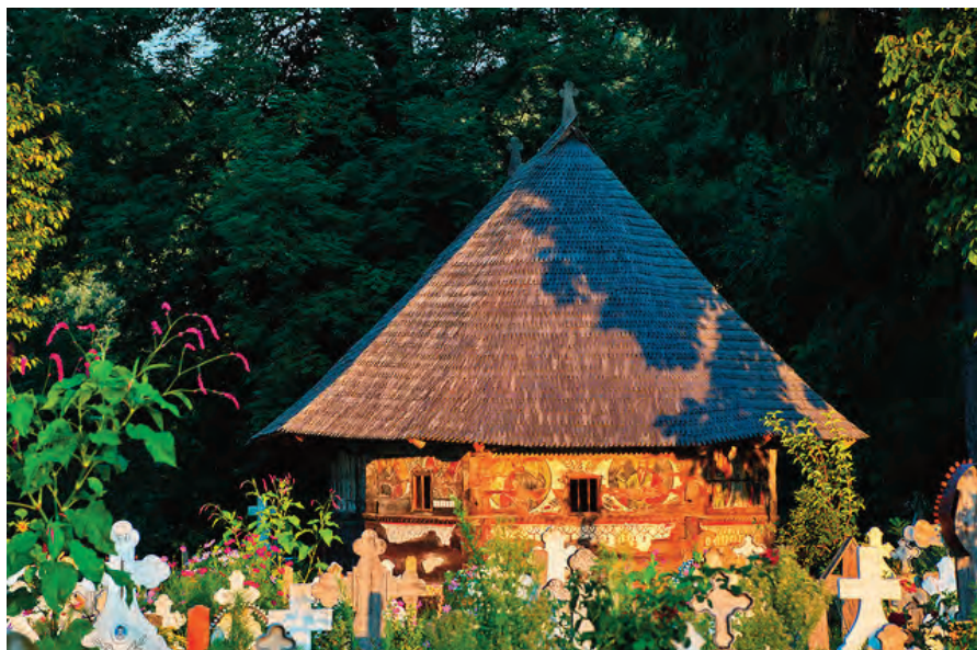
The 18th century wooden church in Ursi

The 18th century wooden church in Ursi is part of the 60 Wooden Churches Project . Its restoration began in 2010 with an emergency intervention, initiated by the Romanian Order of Architects, and