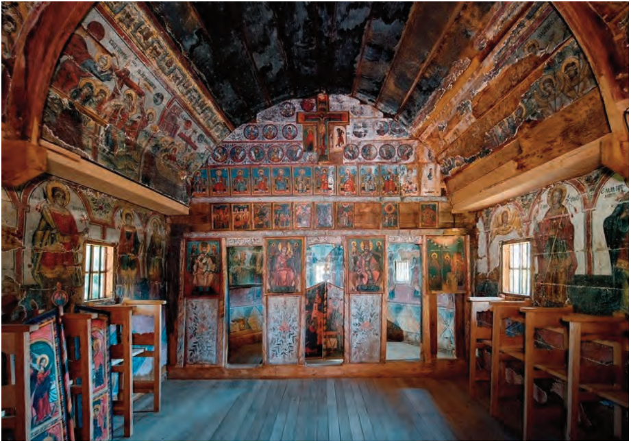
Interior of the 18th century wooden church in Ursi

the best ways to restore buildings on a limited budget without jeopardising the character and integrity of the original fabric.