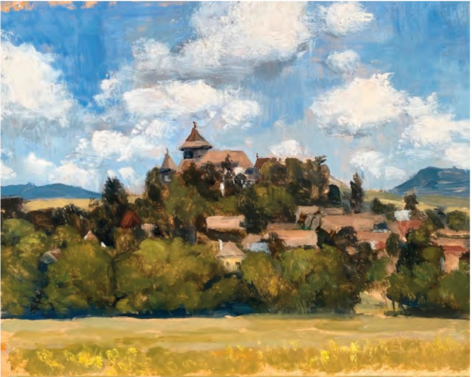
Tobit Roche, View of Viscri, (2) oil on board, 21 x 27 cm (unframed size)